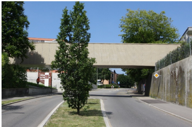
View sky walk