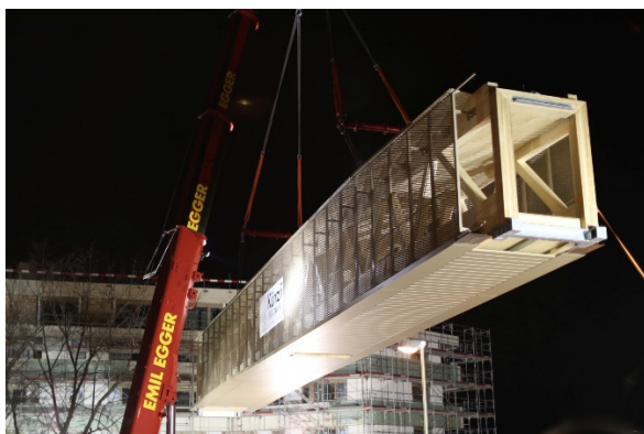
Construction and assembly phase