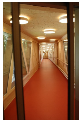
Internal view sky walk